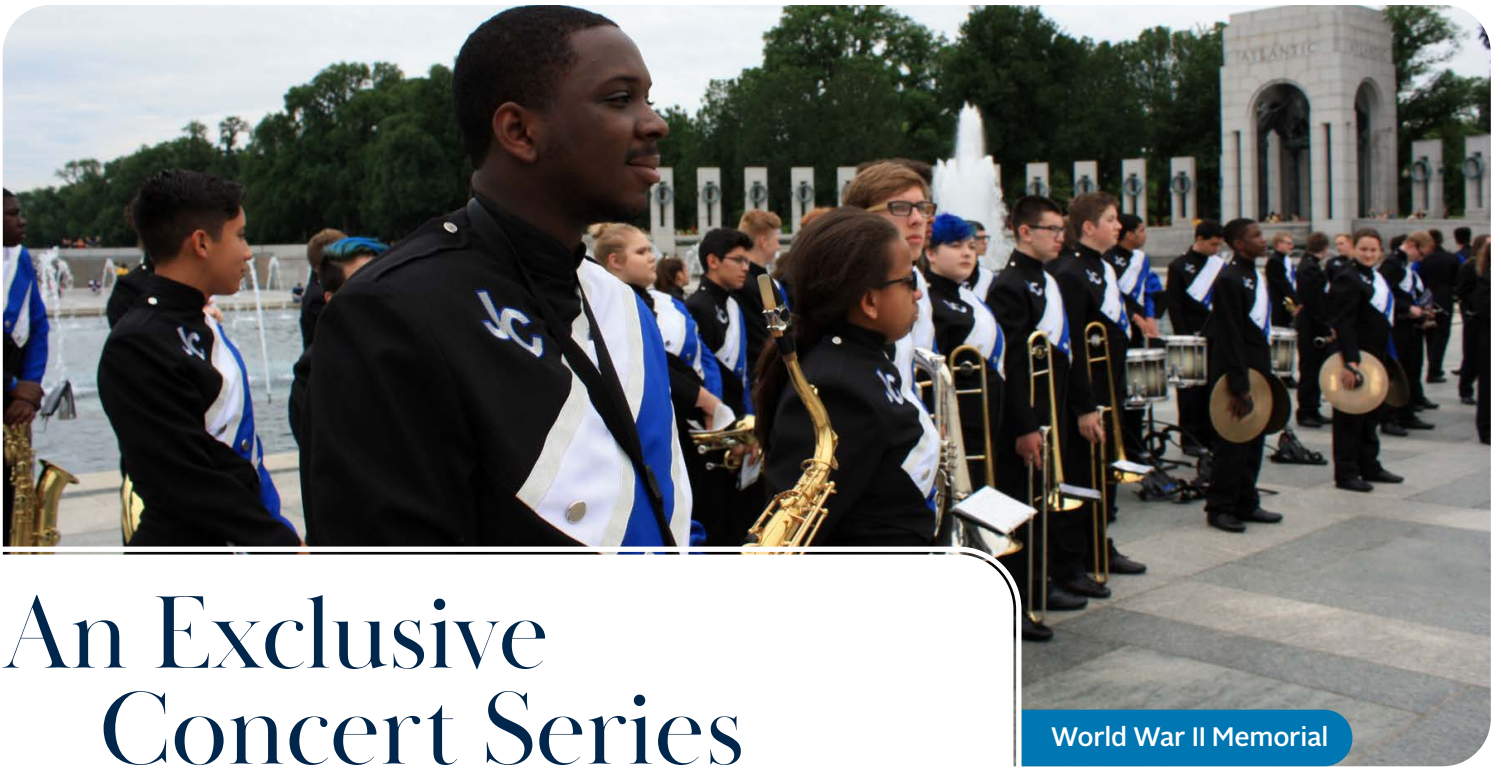
World War II Memorial