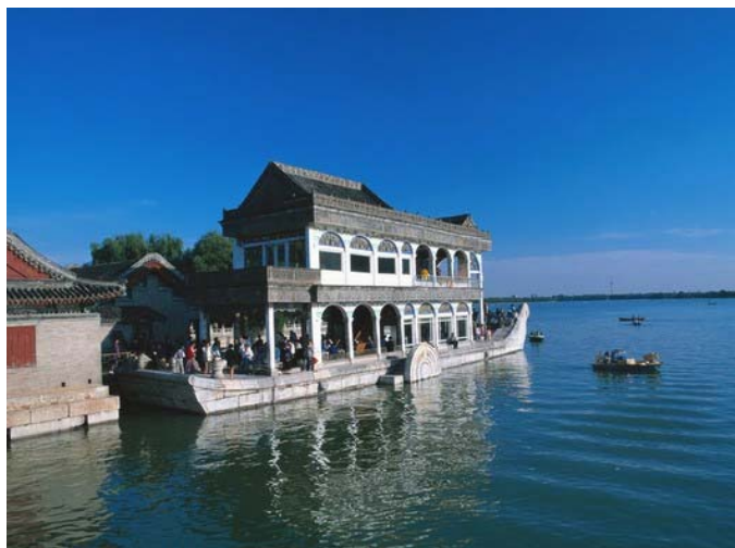
Marble Boat at the Summer Palace

Return home in the evening of the same day