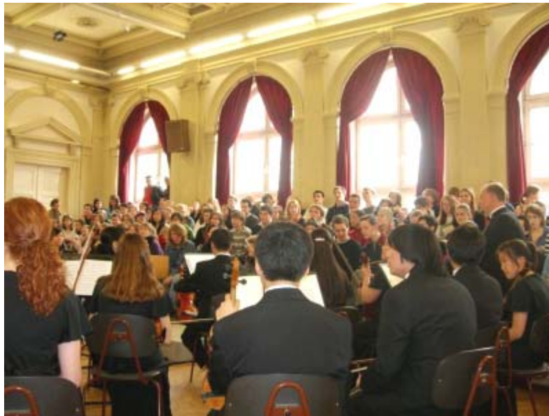
American orchestra performing in an Austrian school