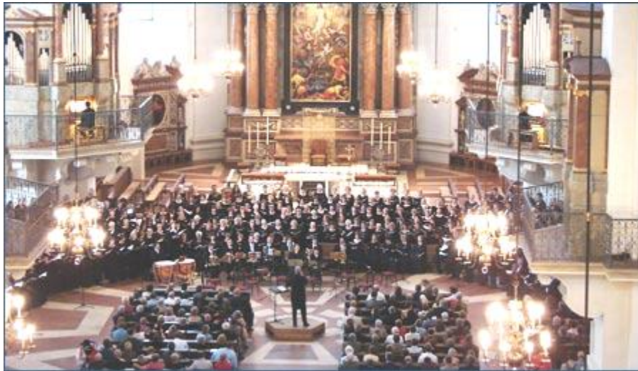
Mozart International Choral Festival in the Salzburg Dom