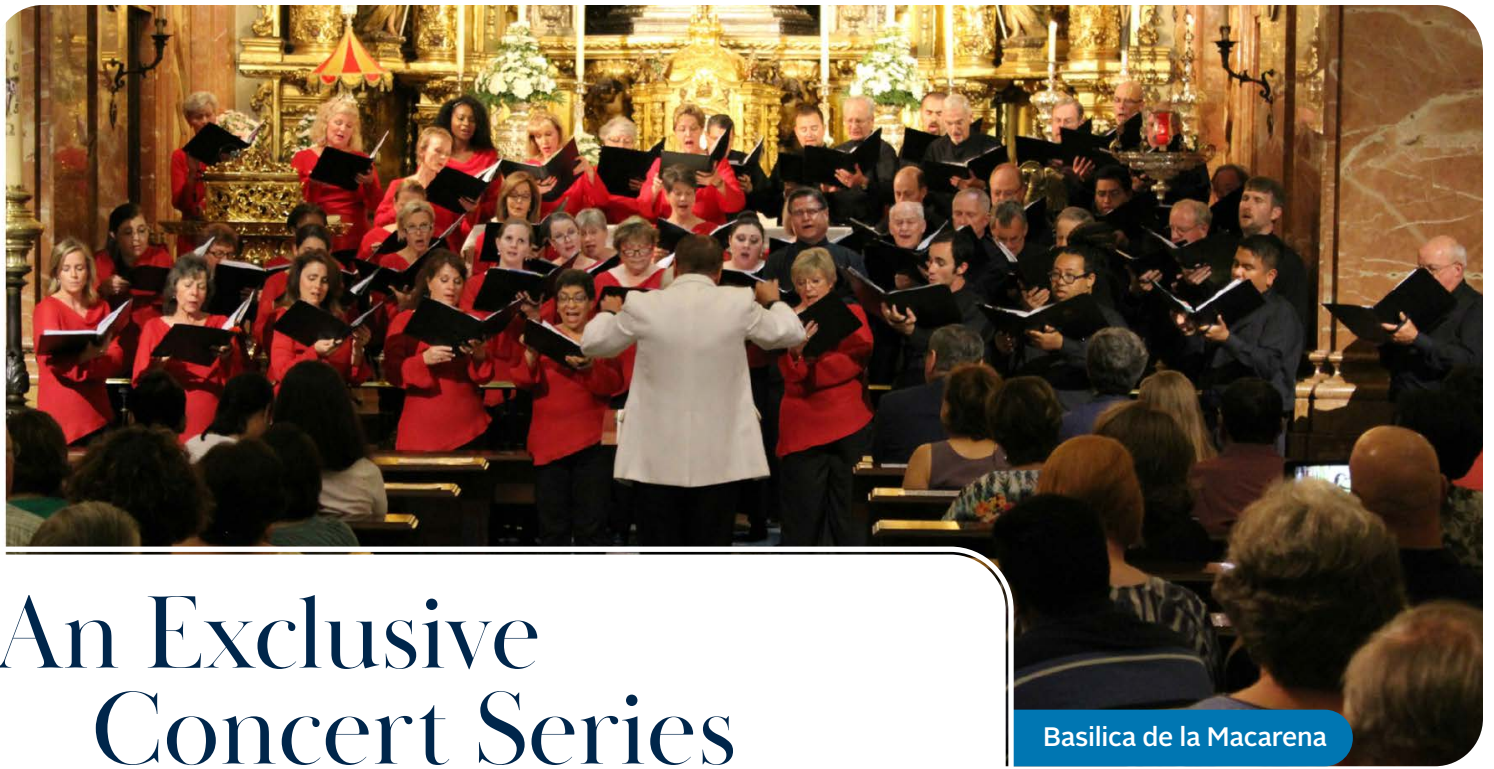
Basilica de la Macarena