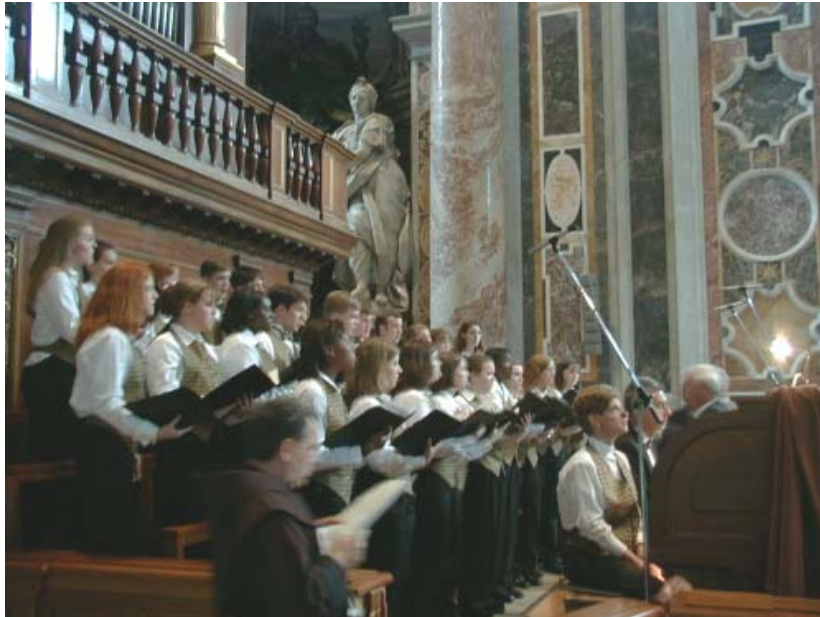
Choir singing in a Mass at St. Peter's Basilica

Early morning transfer to Milan's International Airport for return flight to USA. Arrive home in the evening of the same day.