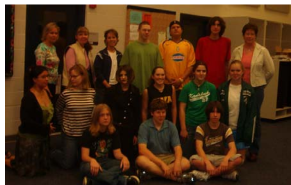
Houston-area travelers at their recent “Meet and Greet” at Seven Lakes HS in Katy.

*Schedule is tentative and subject to change